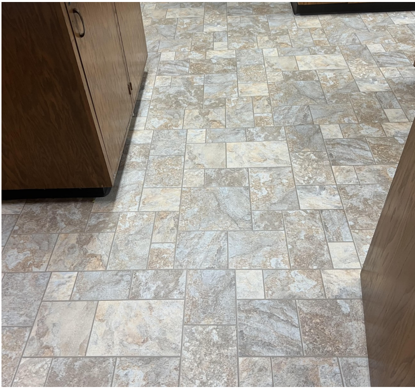
New kitchen flooring