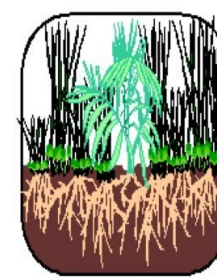
The Weedy Soil