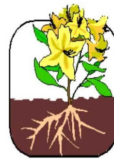
The Good Soil